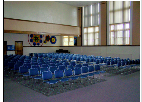
New Carpeting & Chairs in the Auditorium