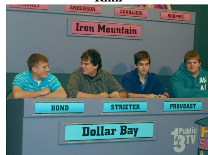
High School Quiz Bowl