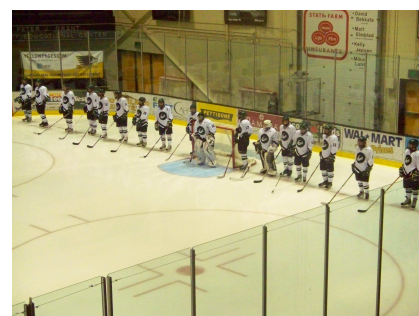
DB Participates in a Co-op Hockey Program with Jeffers