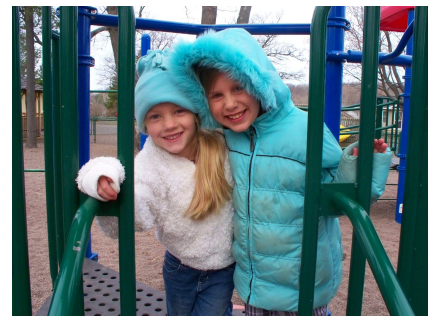
Best Friends Playing on the Playground