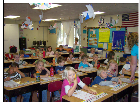
New Desks in 1 st -3 rd Grade