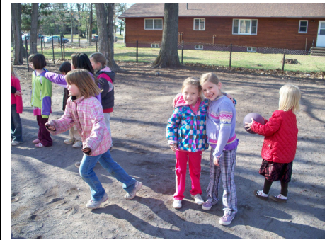
Having Fun on the Playground