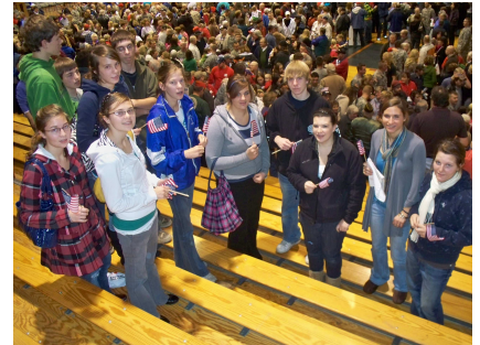
DB Students Welcome Home the National Guard