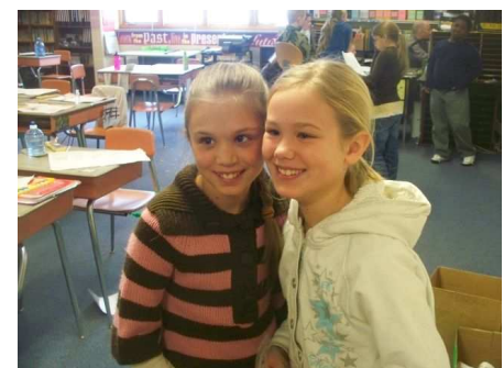
Good Friends in the Elementary