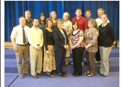
High School Faculty