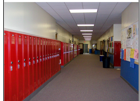
Newer Lockers & New Carpeting – 2 nd floor