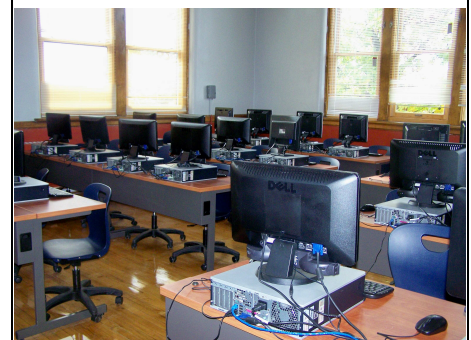
New Computer Lab